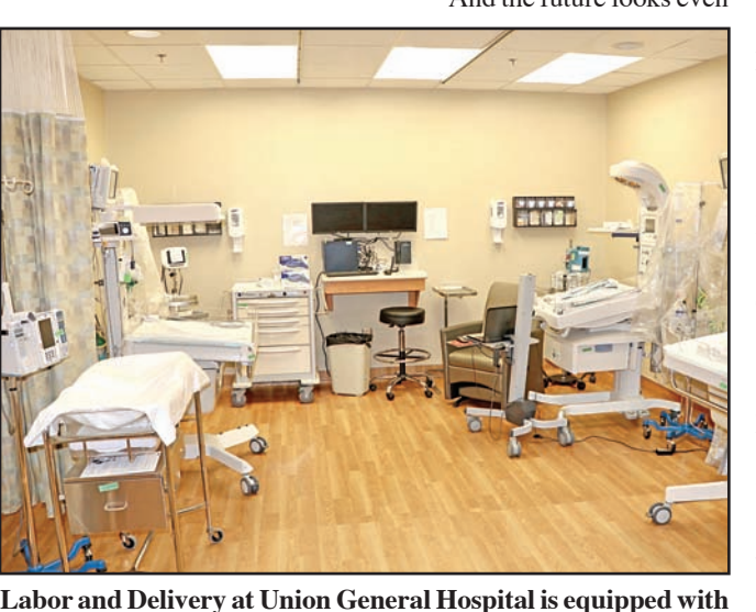
everything families need to feel comfortable having children in the mountains.