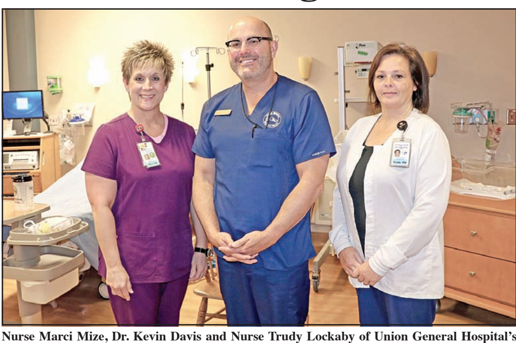
Labor and Delivery unit.